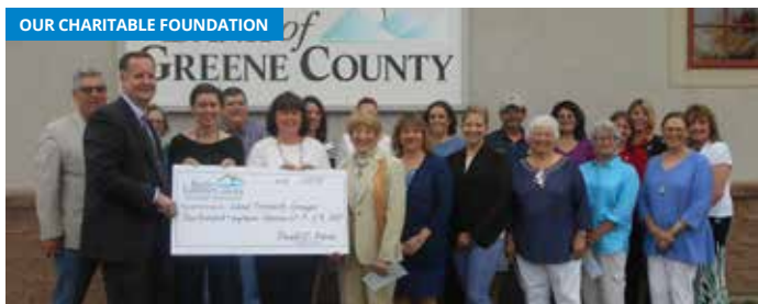
The Bank of Greene County representatives present local non-profit organizations with donations from the Bank's Charitable Foundation at the Catskill Commons Branch.