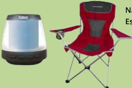
Naxa Bluetooth Speaker Escalade Collapsible Chair

FREE e-Checking that pays CD-like interest & one of these FREE GIFTS!