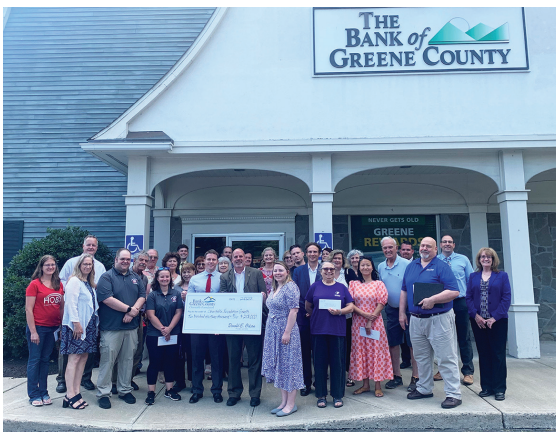
The Bank's Charitable Foundation supports many community organizations.

For more than 130 years, the Bank of Greene County has served its neighbors in New York's Hudson Valley and Capital Region. We live, work, and give back to the communities we serve. Our personal service, local decision-making, and participation in community activities is important to us. We invite you to stop by any branch location, explore our website at www.tbogc.com , or give us a call at 518-943-2600 to learn more about the advantages of banking with us. Thank you for the opportunity to serve you.